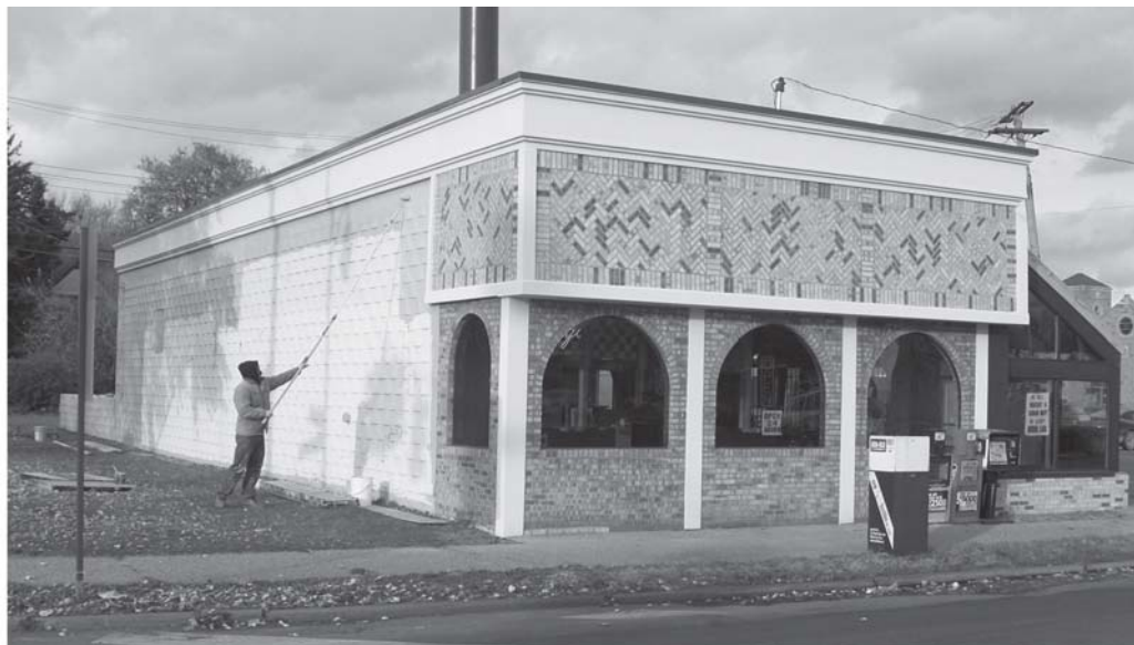
Worker applies paint to the masonry walls of the building; a new roof over the greenhouse and new signage will complete the facade improvements.