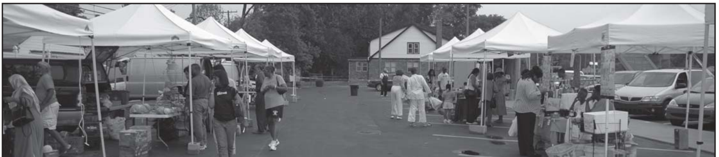
The Northwest Detroit Farmers' Market begins its third season on June 4, 2009.