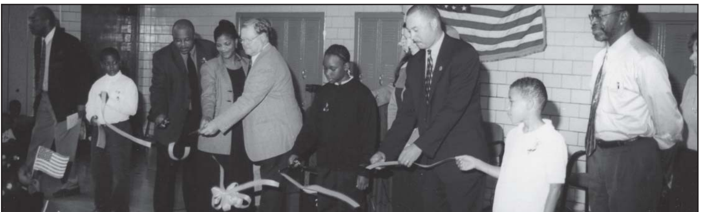
Kids and officials from Edison School in fall 2001, at the ribbon-cutting of their new playground, constructed with help from GRDC.